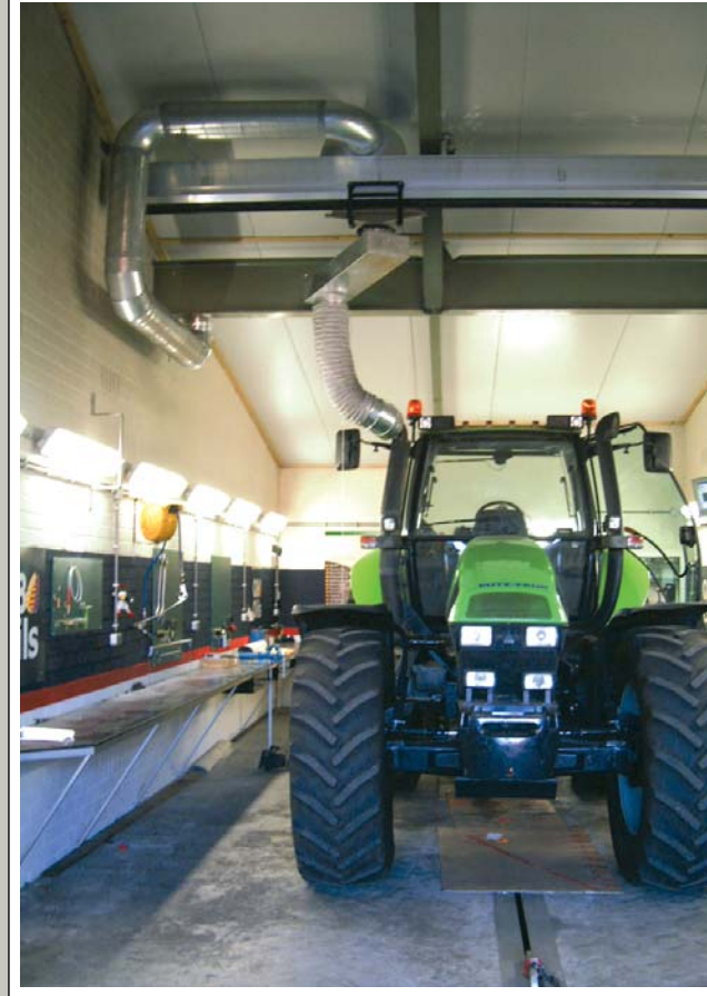
Performance rest / dyno test bed for haulers. Rail system SSK 450 with high temperature extraction unit