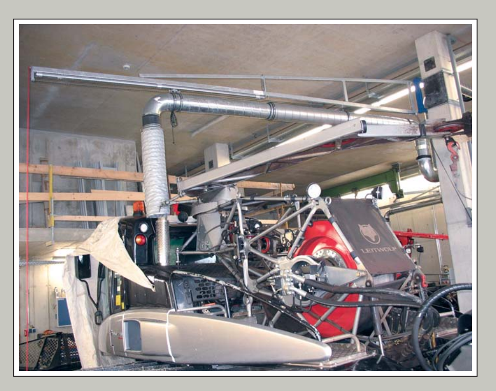
Telescope pipe boom in high temperature version for special vehicles.