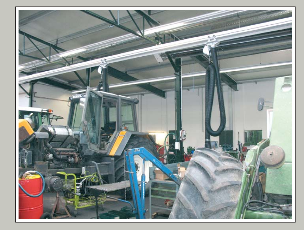
Rail system SSK 290 with 2 hose trolley units for nominal diameter 100 mm.