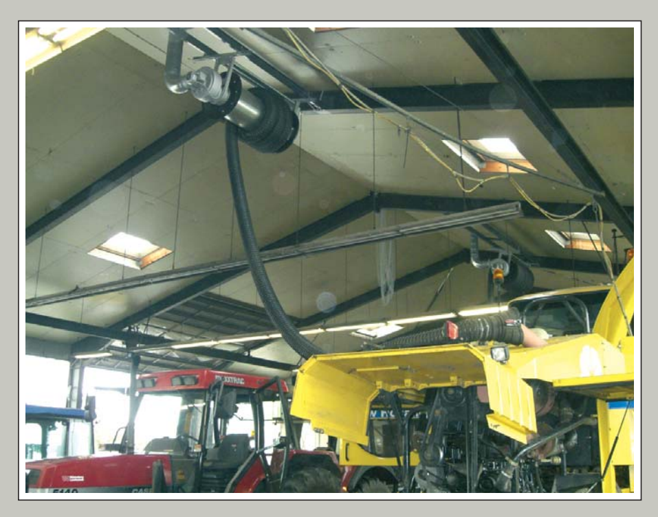
Compact hose reel with fan mounted on the side. Hose length: 15 m.