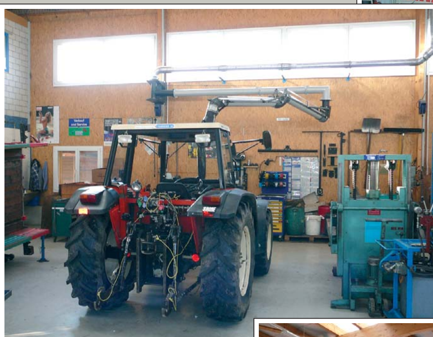
Extraction arm with a reach of 8 m for upward facing exhaust pipes