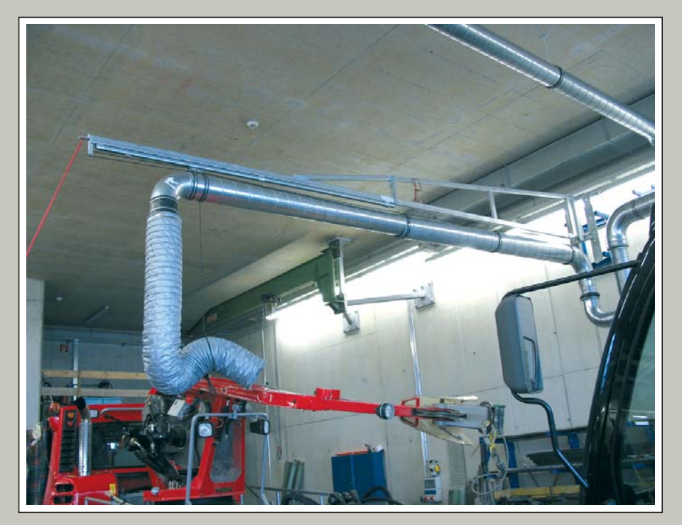
Rail system SSK 290 with hose trolley for nominal diameter 200 mm.