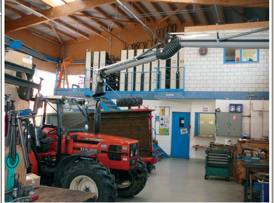
Extraction system with large reach in the agricultural machine shop