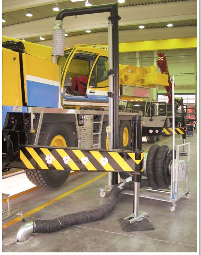
Mobile extraction hose reel (on carriage) for overhead high exhaust systems. Easy attachment on existing under floor extraction system.

High temperature – Extraction unit for performance test / dyno test.